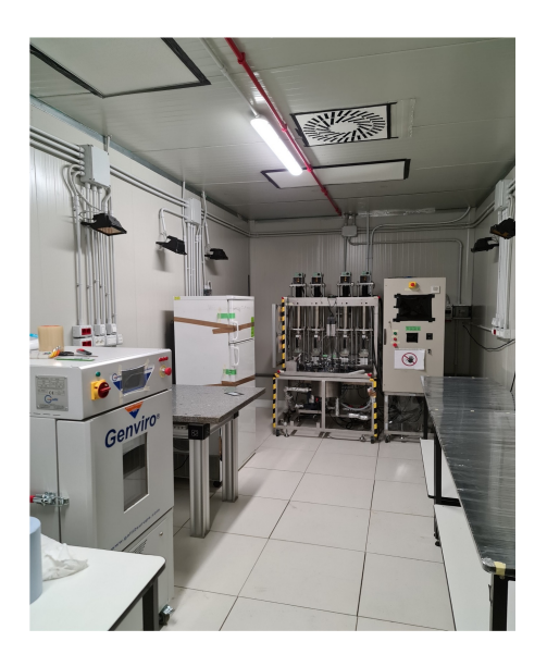
Figure 1: Room of the Facility in the LNGS Hall F hosting the emulsion production machine.

about 1 month. The aim is to measure the detectable background from environmental and intrinsic sources and to validate estimates from simulations. The confirmation of a negligible background will pave the way for the construction of a pilot experiment with an exposure of about 10 kg year. The experimental setup is located in the Hall C of the underground Gran Sasso Laboratory and it consists of a shield from environmental backgrounds and a cooling system to ensure the required temperature level to the NIT emulsion detector. The optimization of the shield structure, along with the definition of the material thickness, was performed with a Geant4 simulation. Results from simulation show that the combination of polyethylene and lead as shielding materials ensures a good rejection power from environmental neutrons and gammas, respectively. In particular, a thickness of 40 cm for the polyethylene blocks and of 10 cm for the lead plates was chosen to get a negligible contribution from environmental background. An emulsion facility with the unique feature of producing emulsion films underground was recently installed in the Hall F underground and it is equipped with an emulsion production machine and all the tools for emulsion pouring and film development. The inner room of the facility hosting the emulsion production machine is shown in Fig. 1 while the shielded structure installed in Hall C is shown in Fig. 2.