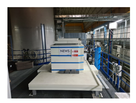
Figure 2: Picture of the shielded structure installed in the underground LNGS Hall C.