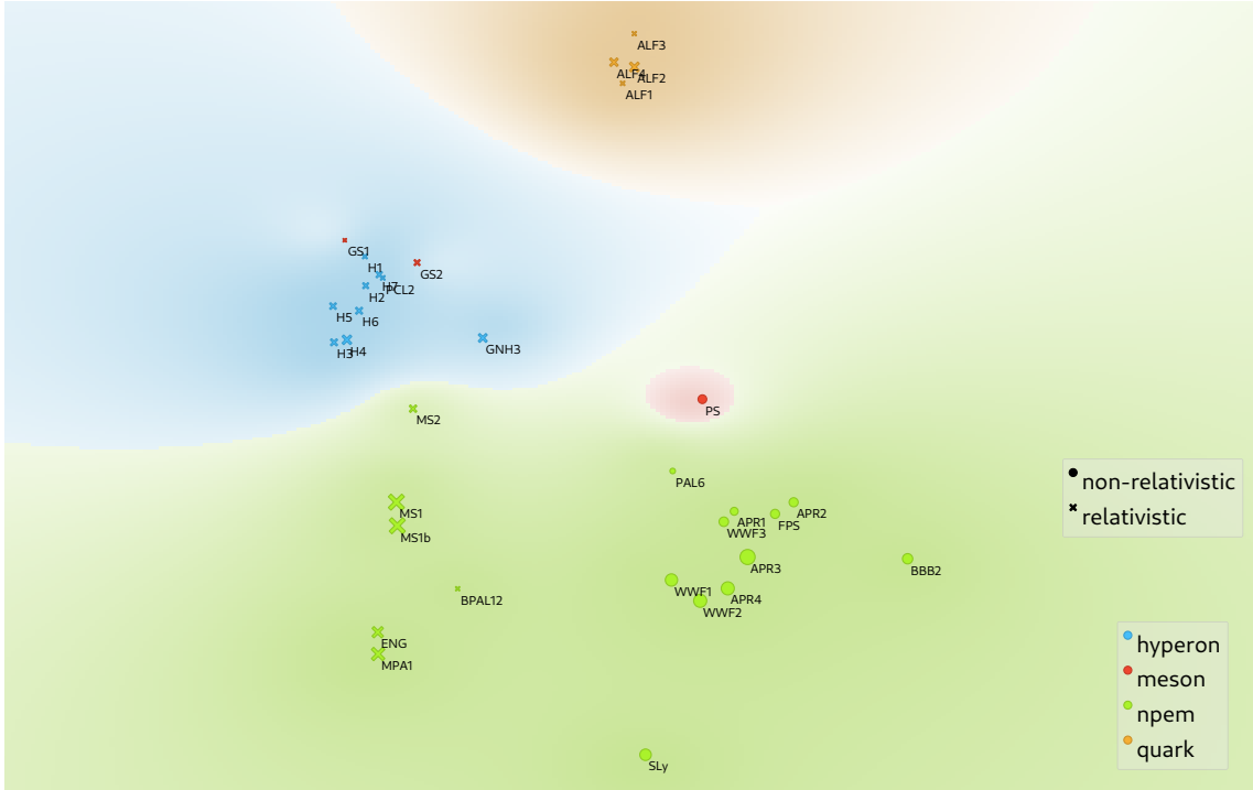
Figure 3: t-SNE using PCA with 6 components. We use the composition of the EoS as colors. In geometric forms, we have the different models.

models. This approach can be very helpful to achieve a better description of nuclear matter at high densities and temperatures.