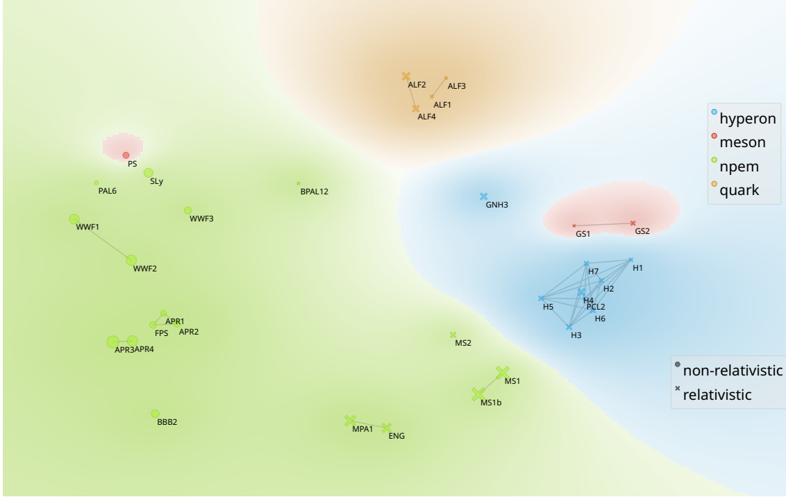
Figure 2: Multidimensional scaling projection using PCA. We use the composition of the EoS as colors. In geometric forms, we display if the model is non-relativistic or relativistic.

located. Regarding the relativistic-K/ \pi /H/q models, it is possible to see one EoS that is an outlier, the GS with its two parameterizations. In figure 2, we have a clear separation of the relativistic and non-relativistic models, however comparing with the previous Fig. 1, we see no correlation of the maximum mass with the nature of the models.