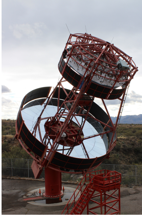
Figure 1: The pSCT at the Whipple Observatory in Arizona.