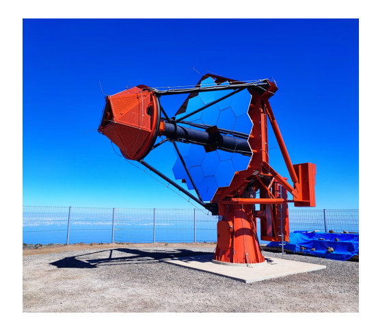
Figure 1: ASTRI-1 the first ASTRI Mini-Array telescope under installation on Mount Teide in Tenerife (Canary Islands, Spain).