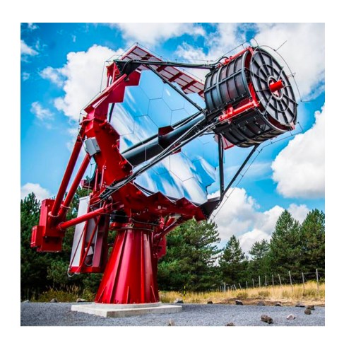
Figure 2: ASTRI-Horn telescope installed on Mt.Etna (Italy) at the INAF "M.G. Fracastoro" observing station.

each Cherenkov camera together with scientific data. They can be used to measure the level of the night sky background (NSB) indirectly and to monitor the presence of stars in the telescope field of view (FoV) allowing to measure with high accuracy, the effective pointing of the telescope [9]. Moreover, with Variance data it is possible to reveal misalignment among mirror panels and check for any degradation of the optical point spread function (PSF) [9]. They are also used for some hardware calibration procedures of the camera such as the evaluation of the breakdown voltage in each pixel of each PDM or the maximum current that can be supplied to PDMs.