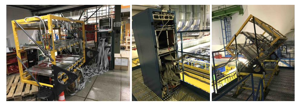
Figure 3: (left) A picture showing the proANUBIS detectors and DAQ chain being tested in CERN BB5 laboratory. (middle) Picture showcasing Data Acquisition (DAQ) rack along with the proANUBIS setup (right) installed on level-12 side-A of the ATLAS underground cavern after lowering through the ATLAS PX14 access shaft.

The commissioning of proANUBIS commenced at CERN BB5 (Figure 3 (left)) during the summer of 2022, where integration and testing were conducted. The triplet (from bottom), singlet, and doublet RPC chambers were inserted into the metallic frame (yellow colour as can be seen in Figure 2), following the design layout depicted in Figure 2. The Data Acquisition System (DAQ) which also includes the high and low voltage systems, underwent testing at BB5 to ensure the functionalities. Once each component was examined and deemed ready for deployment, the entire proANUBIS setup was transported to its designated location at LHC Point 1 within the ATLAS experiment at CERN. To safeguard the detector's integrity during transport, diligent care was taken in handling and securing the proANUBIS unit.